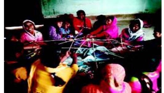
Activity in youth club