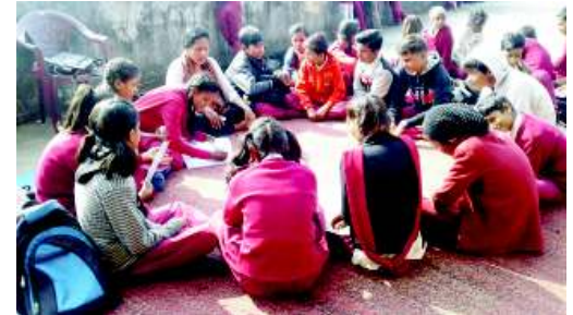
Bal Sansad meeting with the members