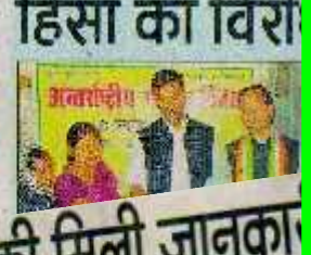
अंतरराष्ट्रीय महिला दिवस पर आयोजित कार्यक्रम

महिलाओं को समान अधिकार देने की वकालत कार्यक्रमों के माध्यम से महिलाओं को समान अधिकार देने की वकालत करने का उद्देश्य है।